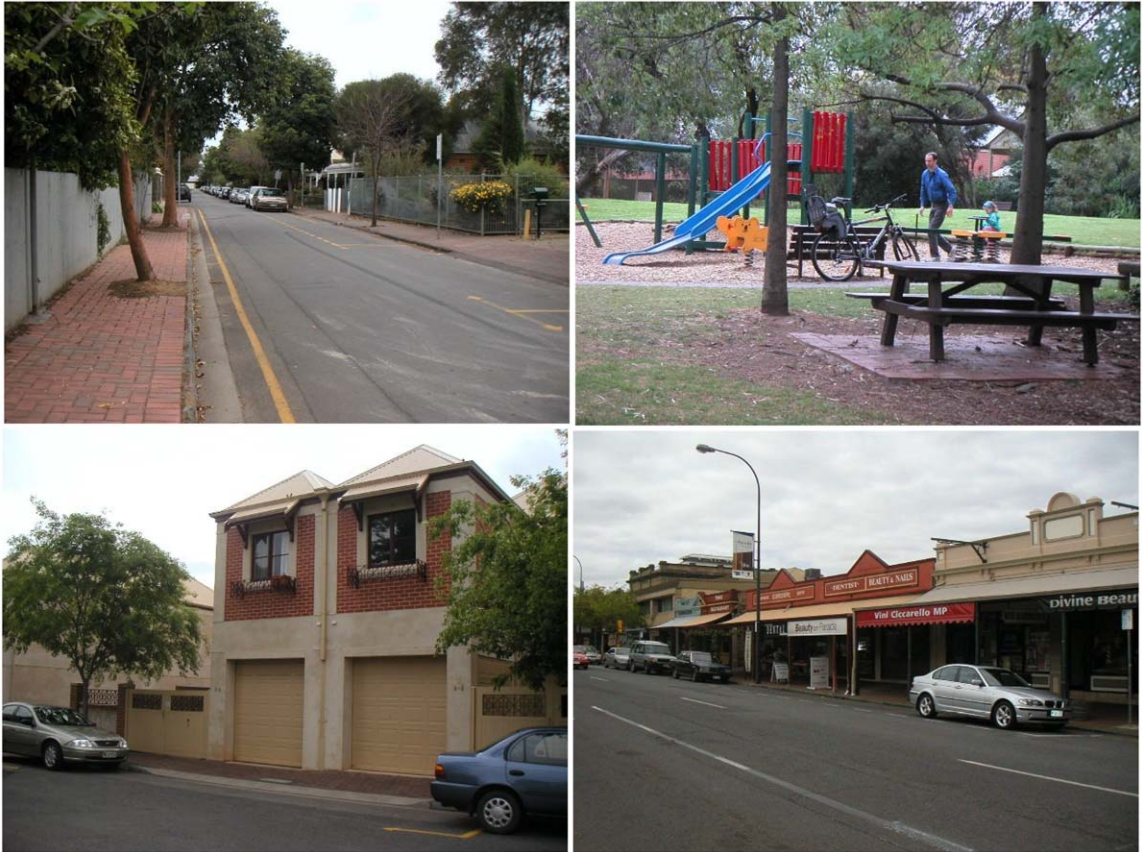
Fig. 2. Norwood neighbourhood characteristics.

evaluation. One week after the second survey was sent, those who had not yet returned the first survey were called by telephone. Two weeks after the second survey was sent, those who had returned the first but not the second survey were reminded by telephone.