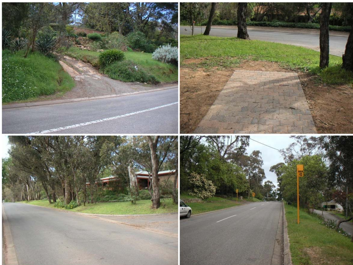
Fig. 3. Hawthorndene neighbourhood characteristics.

single-family residences), as these dwelling types are far more prevalent in their study areas. Having weighted the residential density, they then summed the adjusted values to create the residential density subscale score. In Adelaide, especially in the Norwood and Hawthorndene neighbourhoods, single-storey dwellings are the norm, with only a few two-storey dwellings in the Norwood area. Therefore, applying weighting to residential density was unnecessary in this instance. The residential density items were combined to derive a residential density subscale score.